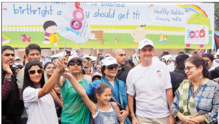
Picture of the event in Delhi 19th August 2012 as it appeared in Times of India

While the 1000- day is a campaign ( http://www.thousanddays.org/ ) which is a global advocacy initiative by governments and UN to focus on critical window period of pregnancy and first 2